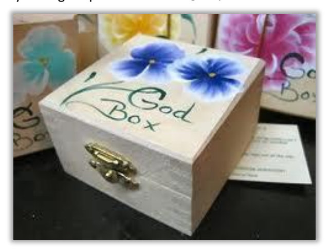
The rule is that....you place it in the God Box and make decision to thereafter let it go!

they share at meetings, administrators of large institutions, the disappearance of books in our culture, the money I've had and squandered, teachers I've